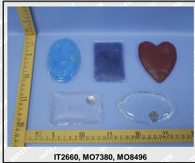
IT2660, MO7380, MO8496