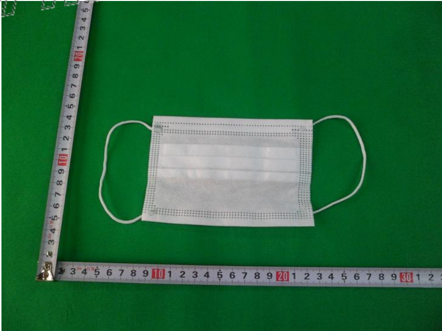
Fig. 4 Overview --- End of report ---