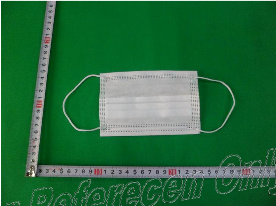
Fig. 3 Overview