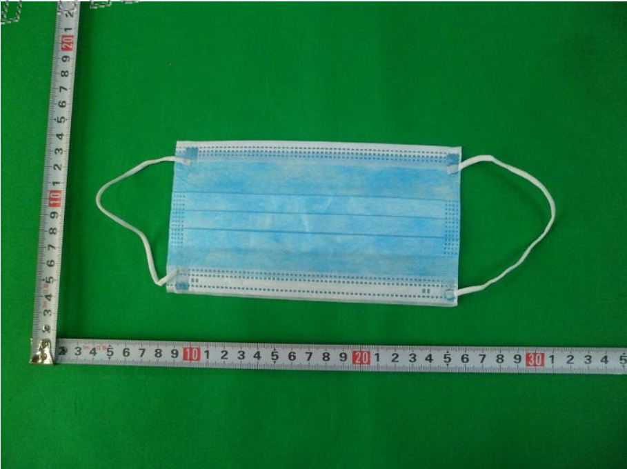
Fig. 2 Overview